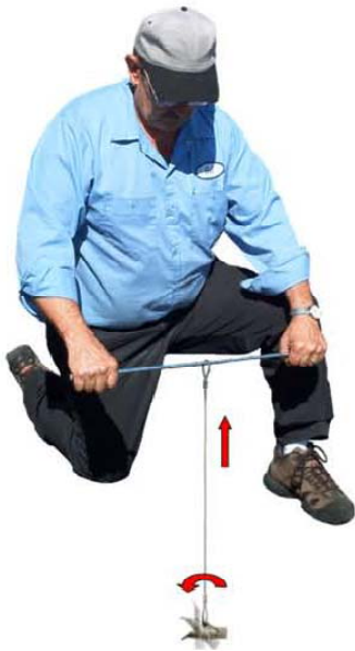
LOCKING WITH DRIVE STEEL

The smaller DUCKBILL models may be locked by hand. Insert the drive steel through the cable loop or wrap the cable around the drive steel to fashion a “T” handle. Pull on the drive steel to anchor-lock the anchor. A fulcrum is also very useful in locking anchors by hand. DUCKBILL “hand hook” is also available.