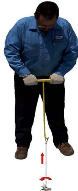
LOCKING WITH HAND HOOK