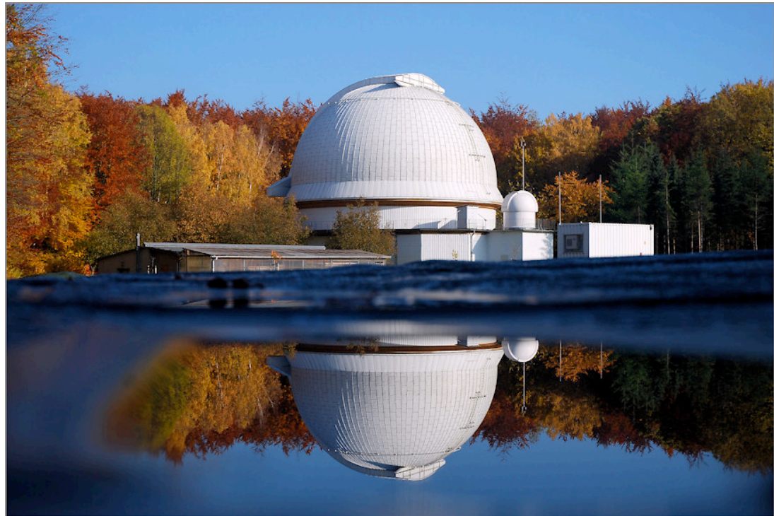
Tautenburg - Oct 2009