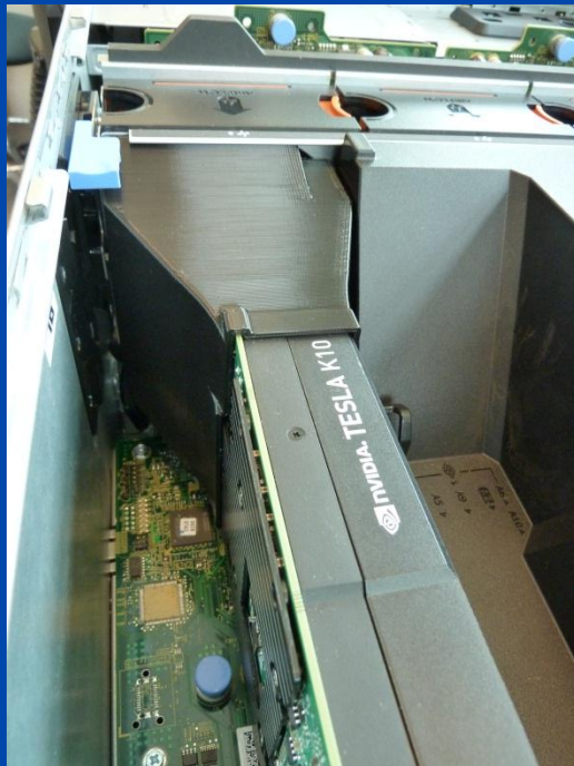
LSM 12 June 2013