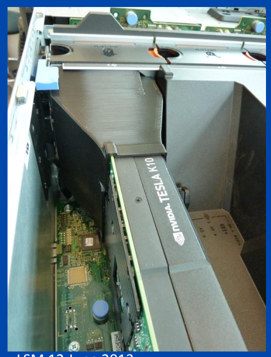
LSM 12 June 2013